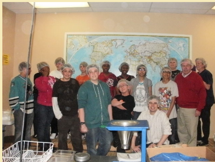
Students at St. Louis Park Junior High School: Community Action Project at Feed My Starving Children

The Human Rights Education program raises awareness of human rights in our communities and provides tools and resources to take action to uphold them. Our main Human Rights Education projects include: