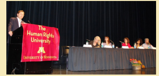
"My Letter to the World: Narrating Human Rights" conference exploring the intersection of human rights and personal narrative (October 2011)

The U of M is uniquely positioned, through its work in human rights, public policy, democracy, development, international relations, and food, agriculture and natural resources to effectively address this global issue and be a leader in helping to set the conditions needed to improve food security.