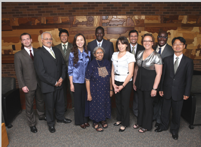
Humphrey Law Fellows, 2011-2012

Each year, the Upper Midwest Fellowship Program provides 25-40 Fellowship awards in the form of living and travel stipends to University of Minnesota law students, graduate students, and others doing human rights work abroad or domestically. Fellowships usually last 10 weeks and Fellows are required to bring their experiences back to the Upper Midwest community by writing or presenting publicly. Since the beginning of the Program, the Center has sent 486 Fellows to 90 countries around the world.